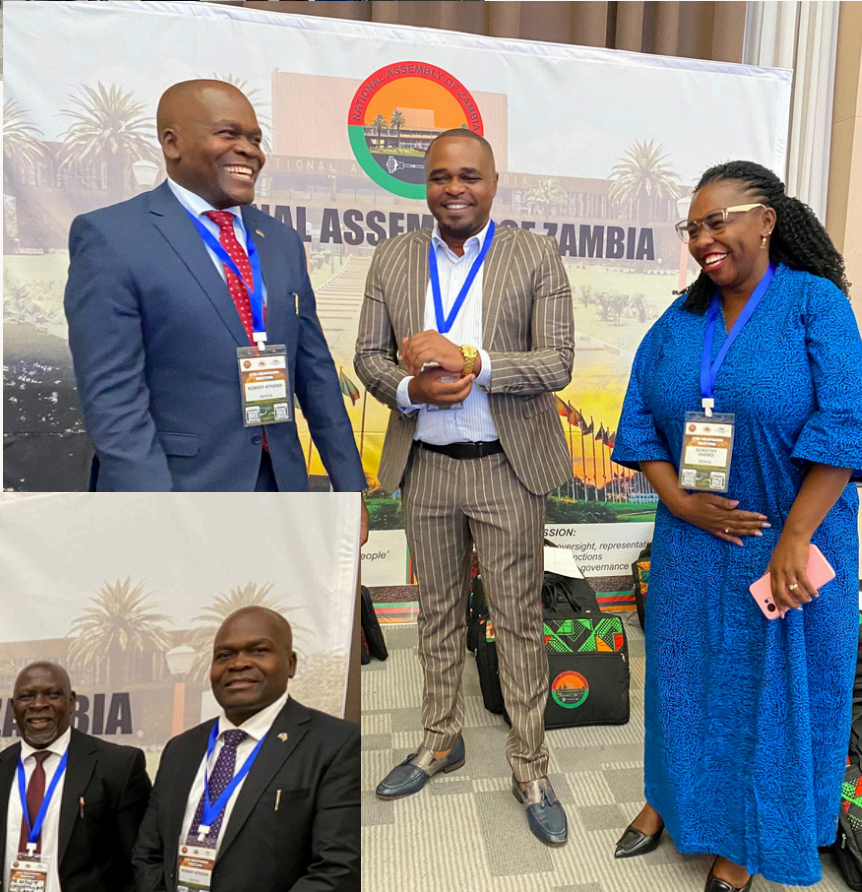
MeTA with Members of Prliament Zambia and AIDS Healthcare Foundation