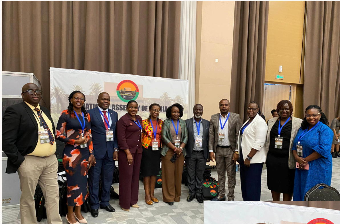
MeTA with MedRap Zambia and other partners